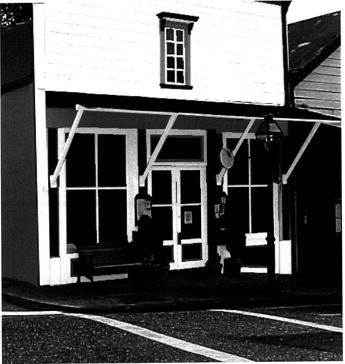
320 Broad Street, Nevada City