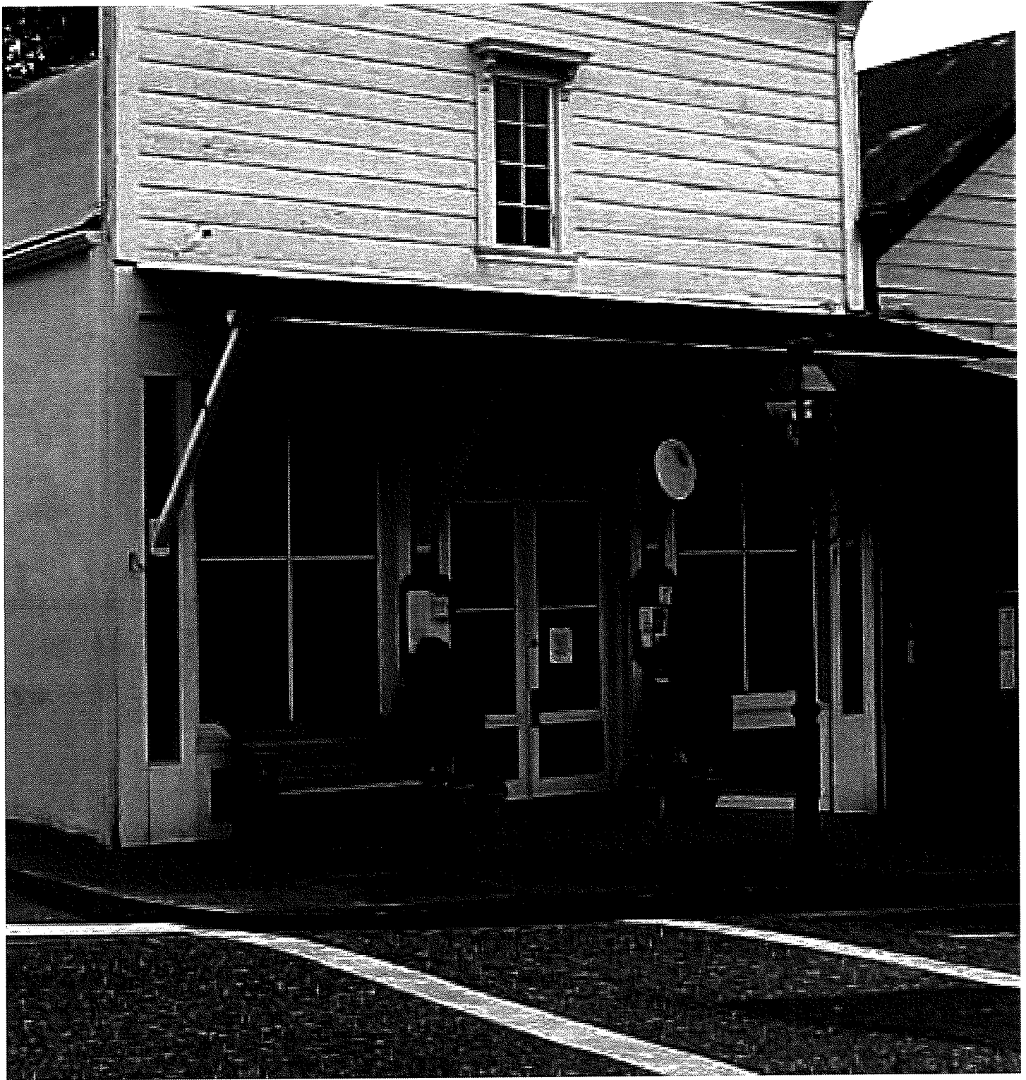
320 Broad Street, Nevada City