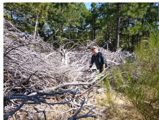
A large pile of dead Manzanita before the clean-up.

If you are interested in participating in future work projects at Sugar Loaf Mountain or other Nevada City locations, contact Nevada City Parks & Recreation at 530-265-2496 x129