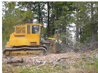
That same pile during the clean up.